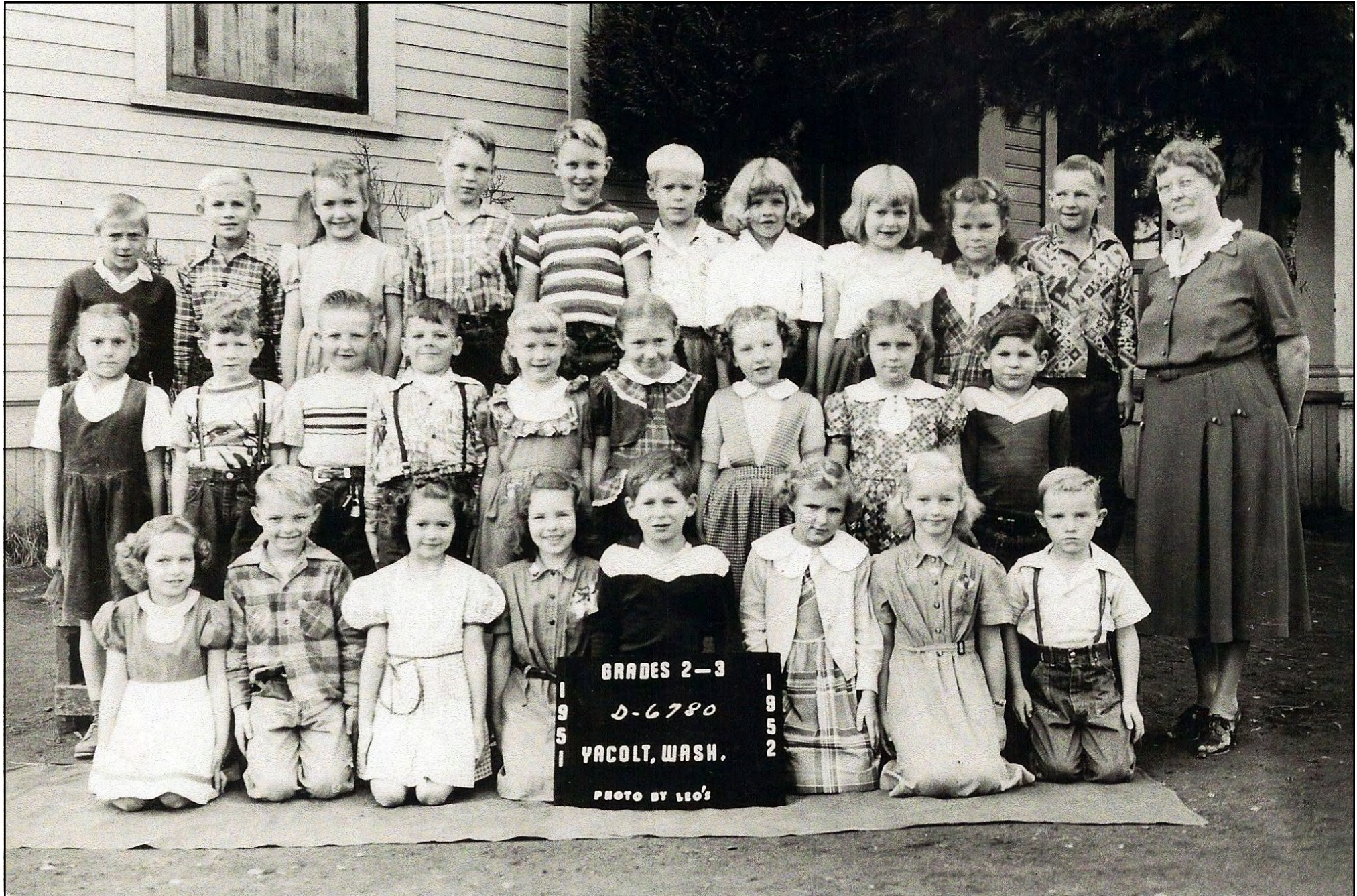
Battle Ground High School Graduation Class of 1962 is in the 2nd grade in this photo Yacolt Elementary School—2nd & 3rd grade photo 1951-1952