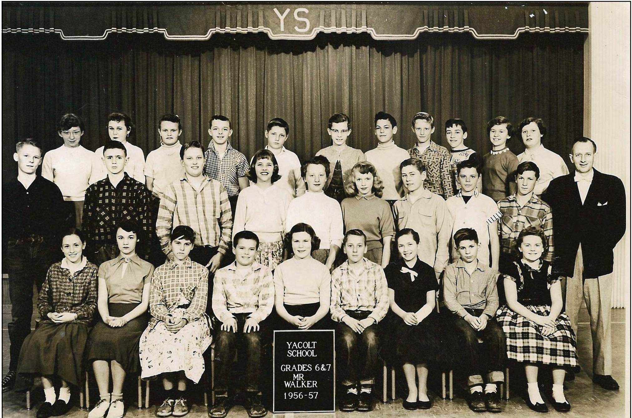
Battle Ground High School Graduation Class of 1962 is in the 7th grade in this photo Yacolt Grade school—6th & 7th grade photo 1956-1957