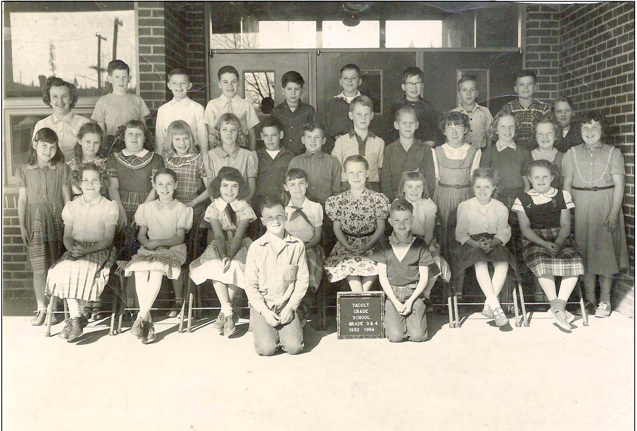
Battle Ground High School Graduation Class of 1962 is in the 4th grade in this photo Yacolt Elementary School—3rd & 4th grade photo 1953-1954