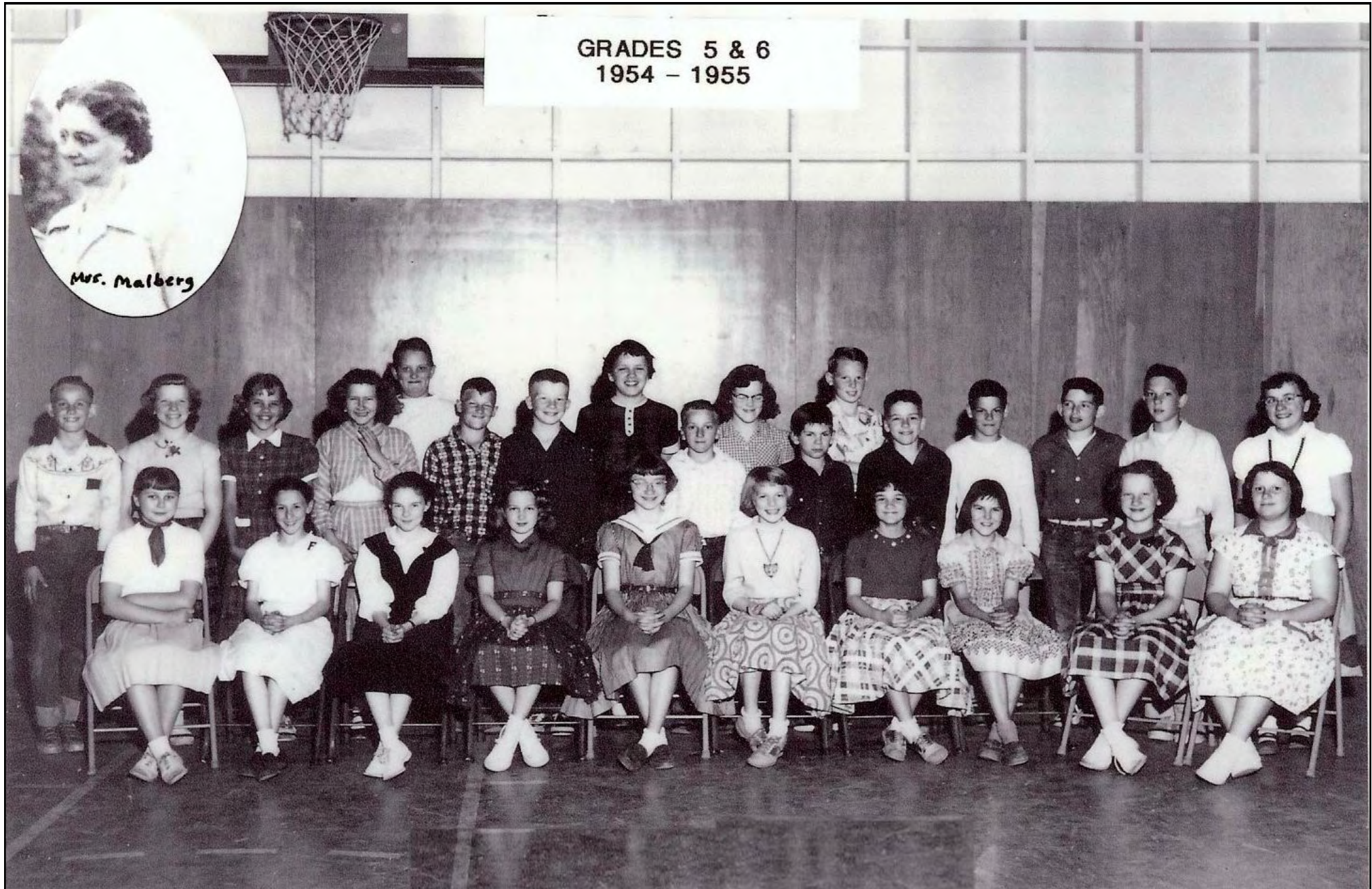
Battle Ground High School Graduation Class of 1962 is in the 5th grade in this photo Yacolt Grade school—5th & 6th grade photo 1954-1955