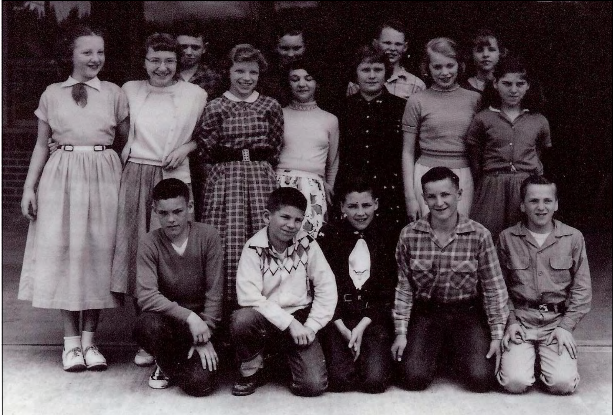
Battle Ground High School Graduation Class of 1962 Yacolt Grade school—6th grade photo 1955-1956