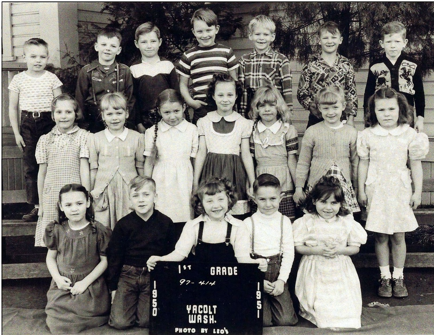
Battle Ground High School Graduation Class of 1962 is in the 1st grade in this photo Yacolt Elementary School—1st grade photo 1950-1951 (Y1a)